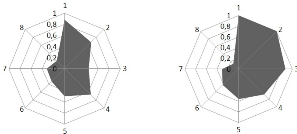
Figure 1. Radars of vehicle quality indicators URAL - 63685 and IVECO AMT – 633920.