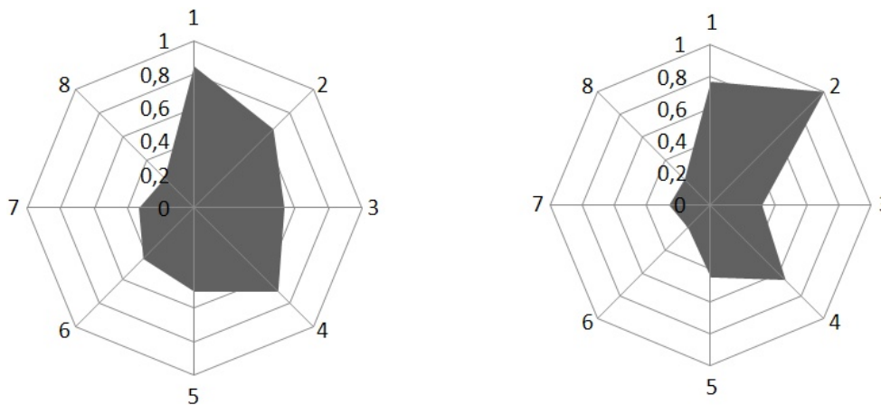
Figure 2. Radars for vehicle quality indicators MAZ-6303A8 and KRAZ-6233M6.

The sum of the coefficients of the IVECO AMT-633920 car is greater than the sum of the coefficients of all others, therefore, the IVECO AMT-633920 log truck has the best technical performance of the four cars under consideration and is most suitable for the ATU of the Sverdlovsk region.