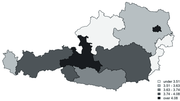
Fig. 5. Spatial EBLUP estimates — S80/S20 Index. Austria

is obtained with EBLUP. This suggests that if the spatial dependence is weak then it is better to use the traditional EBLUP. The region of Wien has the highest percentage of poor, followed by Tyrol and Karnten. The richest regions are Oberösterreich and Burgenland.