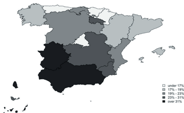
Fig. 1. HCR spatial EBLUP estimates. Spain 2011