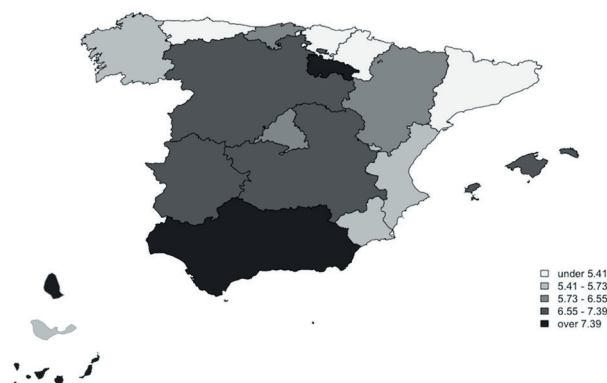
Fig. 2. S80/S20 spatial EBLUP estimates. Spain 2011