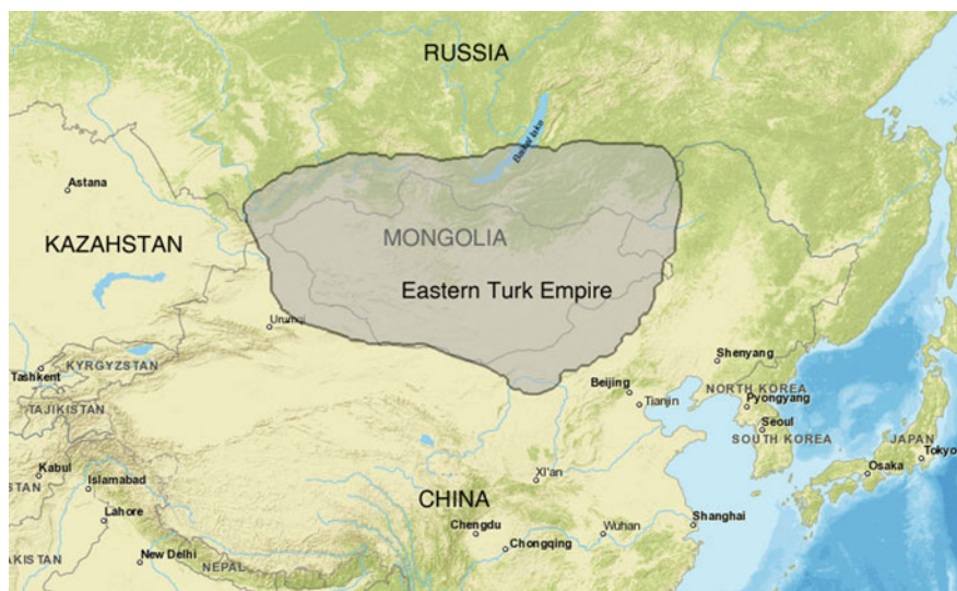
Fig. 8.1 Map of the Eastern Turk Empire

Researchers divide the history of the Turk Empire into several periods (Sinor 1990b; Barfield 1992; Gumilev 1967; Klyashtorny 1964; Beckwith 2009). The first (AD 534–630) is characterized by the appearance of the Turks on the Chinese border and the beginning of intensive Turkic-Chinese trade relations accompanied by a gradual strengthening and broadening of the spheres of influence of the nomadic state. In the second period (AD 630–679) the independent state of the Turks was non-existent anymore. The main reason for the defeat of the Turks is considered to be the military campaign undertaken by Emperor Taizong in AD 630 which was later followed by his active policy in strengthening China in AD 630–649. The consequence of this was that the Turks were no longer a serious military or political threat until the year