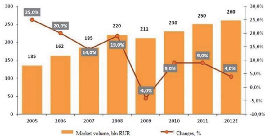
Fig. 2. Dynamics of the volume of chargeable dental services market in Russia, 2005-2012, billion rubles, %

The Russian market of chargeable dental services started its active development in the early 1990s. Currently, the market has stabilized in terms of both quantity and quality, having achieved the saturation stage and certain growth limits. According to experts, competitive advantages of the dental business are particularly optimistic for those vertically integrated companies, which are able to focus on rendering highly technical services.