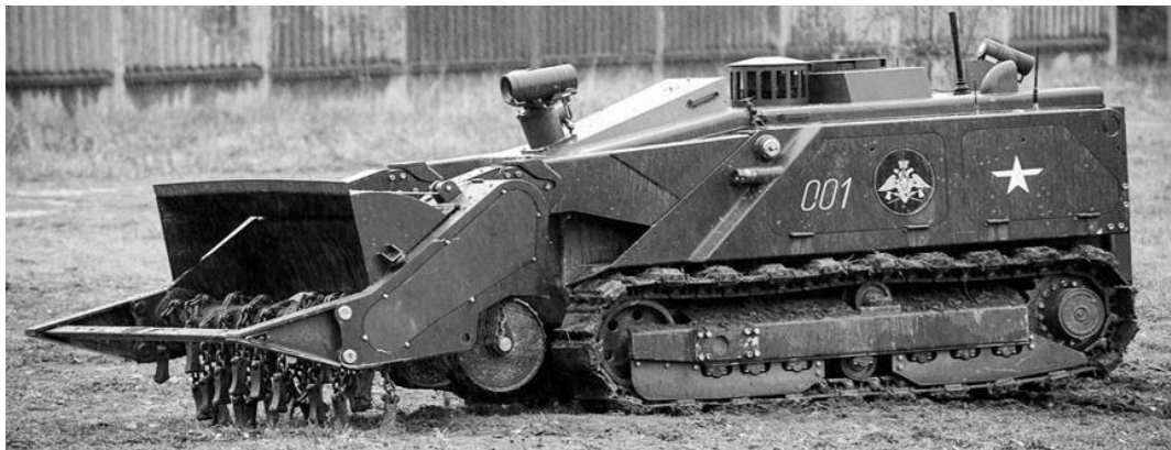
Figure 1. Robotic Demining Complex 'Uran-6'.

Russia can offer such RC as the specialized remote controlled robot 'Uran-6' (Figure 1), 'Platforma-M', 'Nerekhta' and other [6].