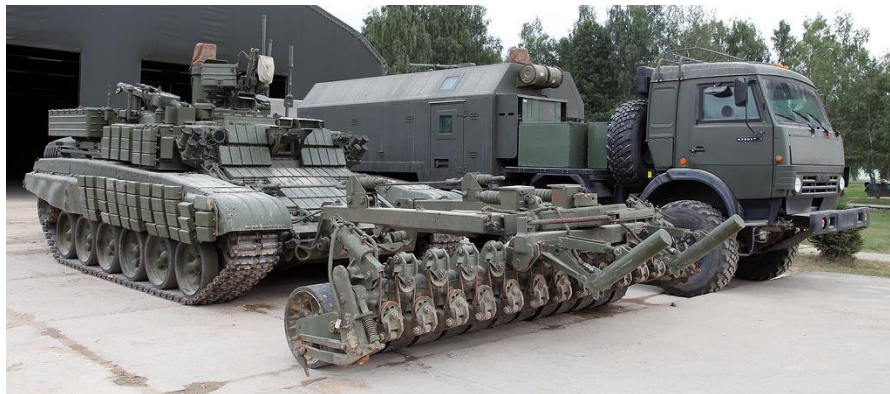
Figure 3. Controlled robotic demining complex 'Prohod-1'.

Further, it is advisable to consider the controlled demining RC 'Prohod-1' (Figure 3) created in JSC 'High precision systems' scientific production association [8]. The complex was created on the basis of BMR-3M 'Vepr' (armored demining machine). The technical capabilities of the complex allow to trawl mines installed on the ground or in snow, to neutralize mines lying on the surface as well as having radio breakers. RC 'Prohod-1' is equipped with a trawl with rollers (for contact action mines), cutters (cut wires of remotely controlled landmines) and a system of radio-electronic interference for radio-controlled landmines. The complex is able to create passages up to 4.5 meters wide in combat conditions for military columns on mined areas both with crew and unmanned (remote and automatic) modes of operation.