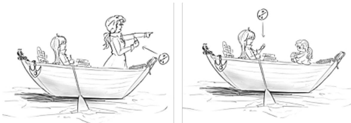
Figure 5. My supervisor: a leader or a companion?