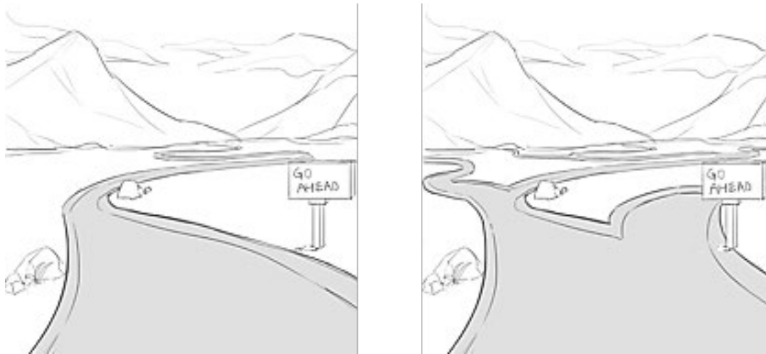
Figure 2. 'Go ahead': ethic guidelines vs. ethical practice

you can reach your destination by following the path. There is the same valley, the same road sign, but countless paths that seem to wind their way forward in the actual situation (Figure 2).