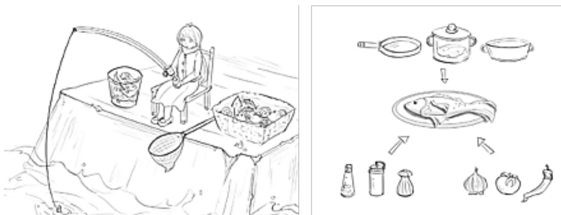
Figure 1. A fishing analogy showing the process of changing my research plan

I took my four fish home that day, but of course I will come back again the next day because I still need more fish. That was by no means the end of the day's story because I need to cook them. I ask myself: What is the best way to cook the fish to keep it delicious (How can I use this evidence to best justify my change) – fried, boiled or stir-fried? What kind of flavor would my diners (supervisors and members of the committee) prefer – more salt, a little bit sour, or tastes very peppery? What vegetables should I add to soften the taste of this fish (How can I make each part seem logical and cohesive) – onions, tomatoes or peppers?