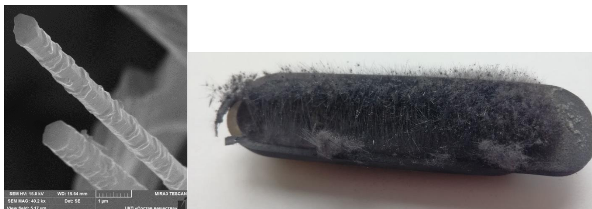
Fig. 1. The image of as synthesized silicon nanowires

Silica reduction mechanism by metastable aluminum monofluoride is still to be considered. According to the thermodynamical calculations, the most probable path could be described by the following reaction: